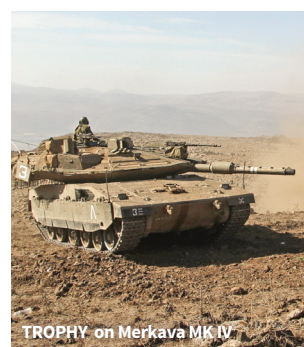
TROPHY on Merkava MK IV