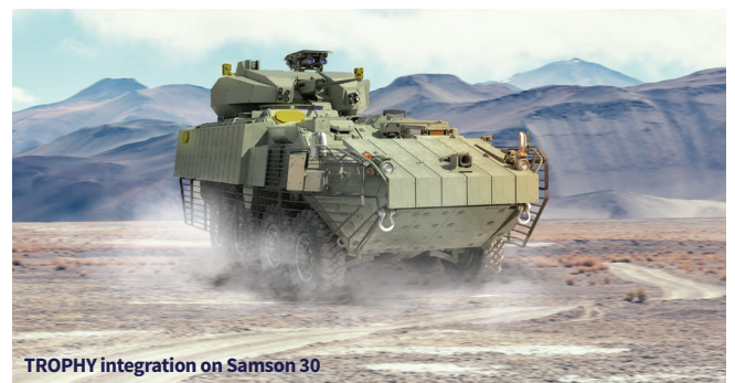
TROPHY integration on Samson 30