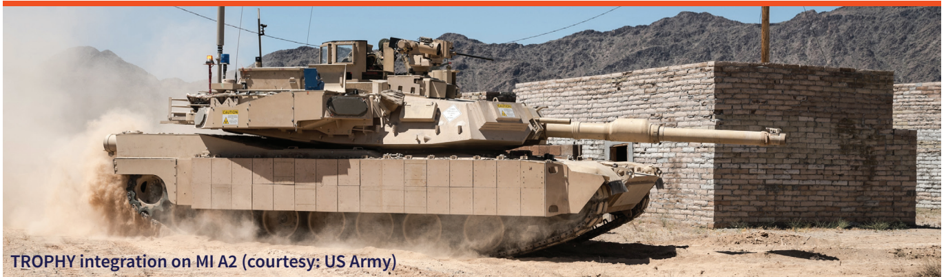
TROPHY integration on MI A2